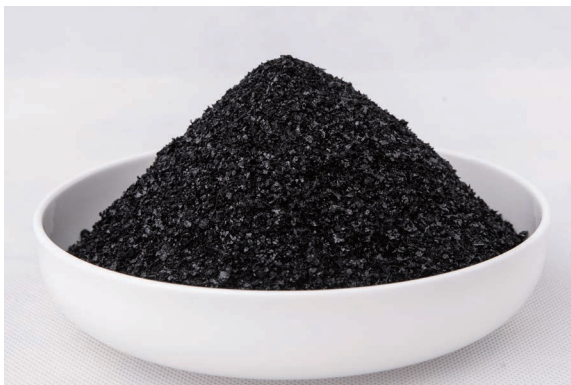
Sodium Humate Flake