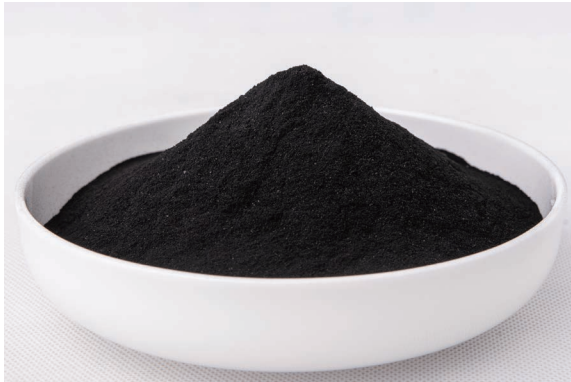
Sodium Humate Powder