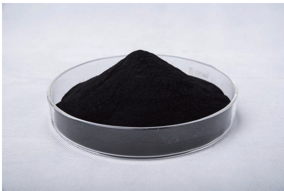
Potassium Humate powder