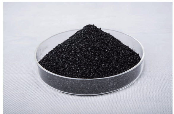
Potassium Humate Flake