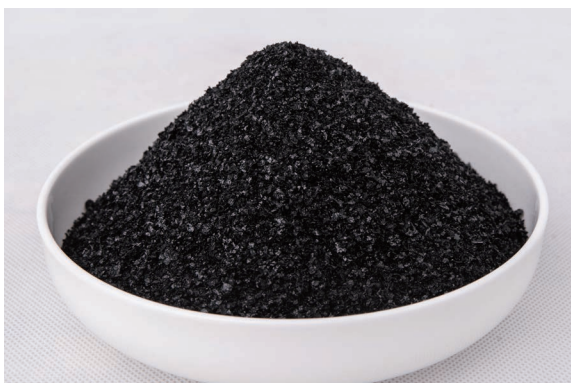
Potassium Fulvic Acid Flake