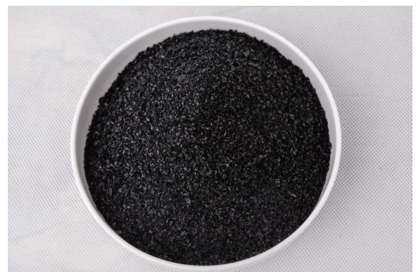
Potassium Fulvic Acid Flake