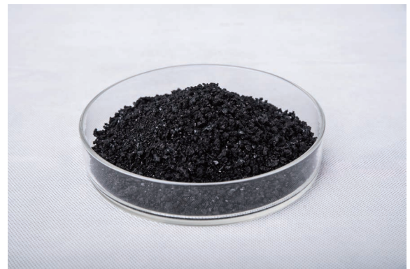
Potassium Humate Particle